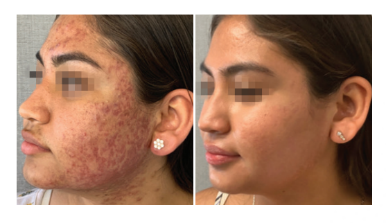
Before and After 2 Genius and Ultra Treatments