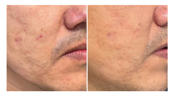
Before and After 3 Genius and Ultra Treatments