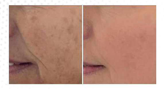
Before and After 3 Genius and Ultra Treatments